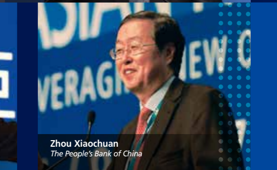
Zhou Xiaochuan The People's Bank of China

2,600+ financial and business leaders and