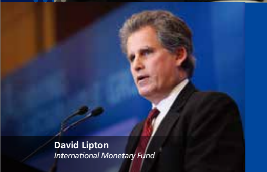
David Lipton International Monetary Fund