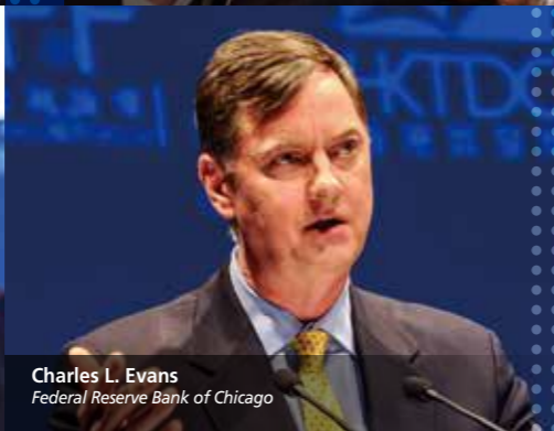
Charles L. Evans Federal Reserve Bank of Chicago