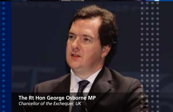
The Rt Hon George Osborne MP Chancellor of the Exchequer, UK