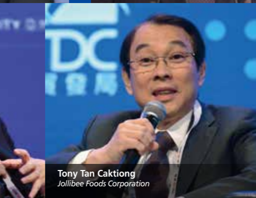
Tony Tan Caktiong Jollibee Foods Corporation