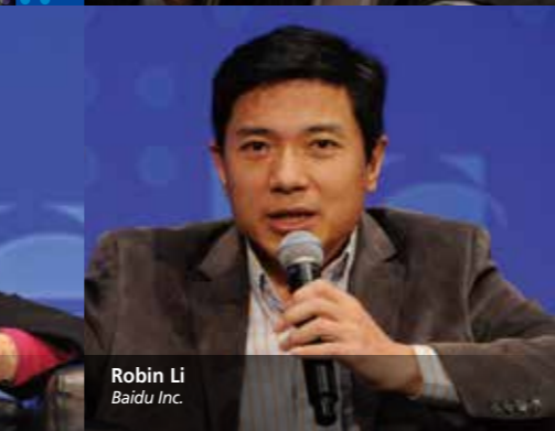
Robin Li Baidu Inc.