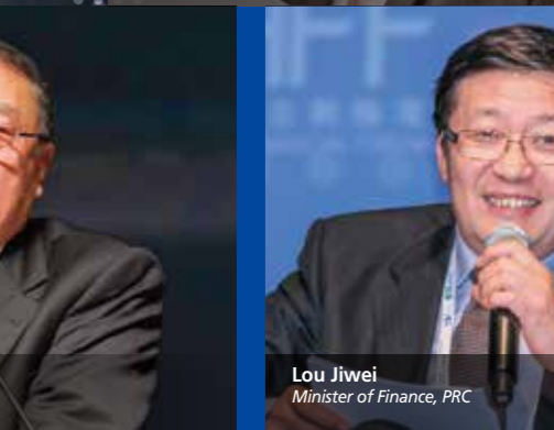
Lou Jiwei Minister of Finance, PRC