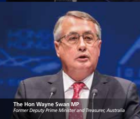
The Hon Wayne Swan MP Former Deputy Prime Minister and Treasurer, Australia