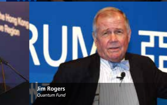
Jim Rogers Quantum Fund