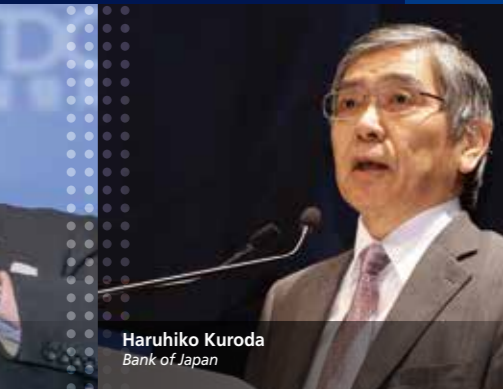
Haruhiko Kuroda Bank of Japan