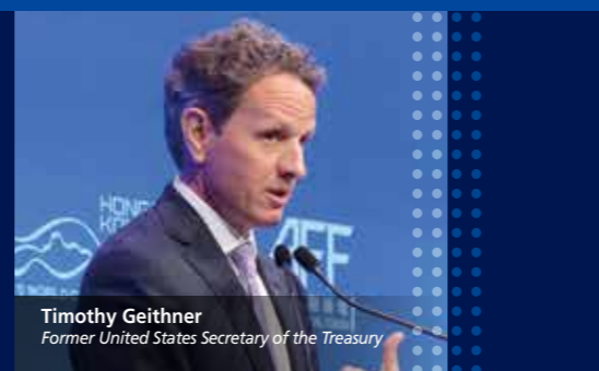
Timothy Geithner Former United States Secretary of the Treasury