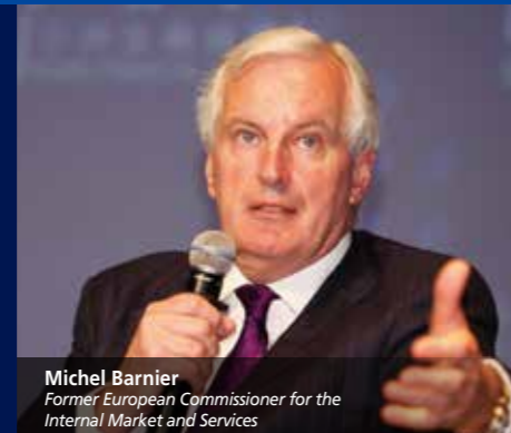
Michel Barnier Former European Commissioner for the Internal Market and Services