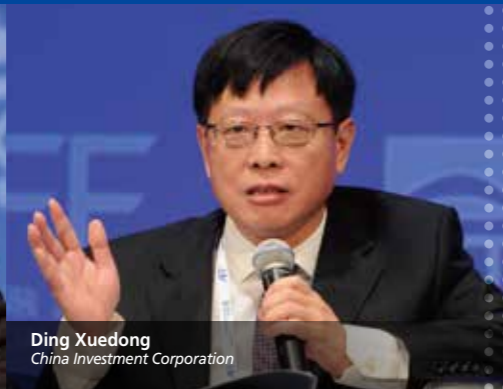
Ding Xuedong China Investment Corporation