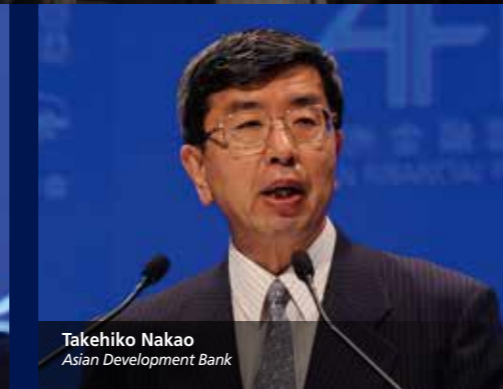
Takehiko Nakao Asian Development Bank