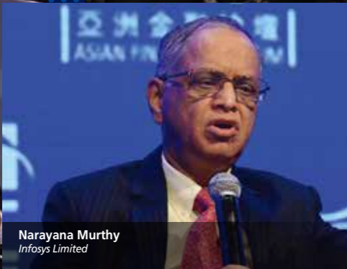
Narayana Murthy Infosys Limited