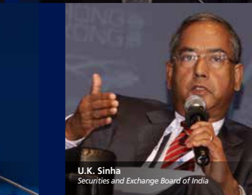
U.K. Sinha Securities and Exchange Board of India