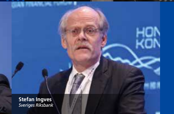
Stefan Ingves Sveriges Riksbank