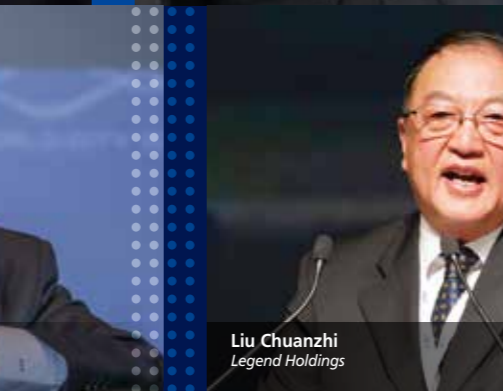
Liu Chuanzhi Legend Holdings