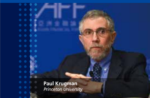
Paul Krugman Princeton University