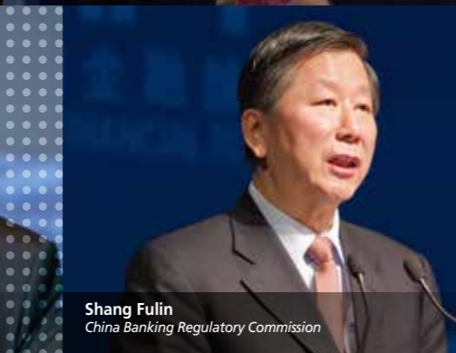
Shang Fulin China Banking Regulatory Commission