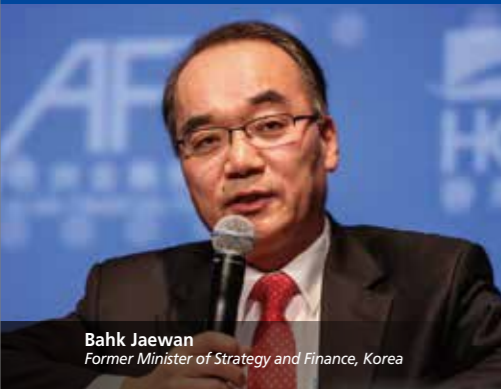
Bahk Jaewan Former Minister of Strategy and Finance, Korea