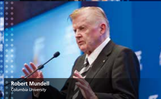
Robert Mundell Columbia University