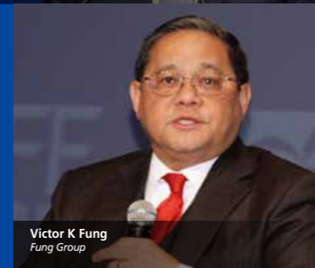
Victor K Fung Fung Group