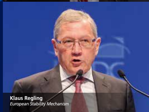
Klaus Regling European Stability Mechanism