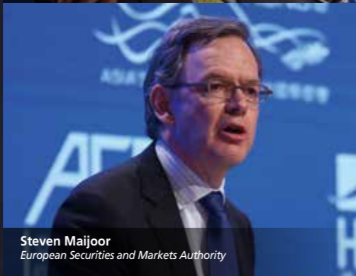
Steven Maijor European Securities and Markets Authority