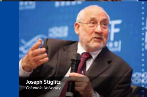
Joseph Stiglitz Columbia University