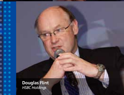
Douglas Flint HSBC Holdings