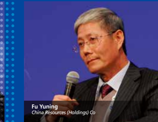
Fu Yuning China Resources (Holdings) Co