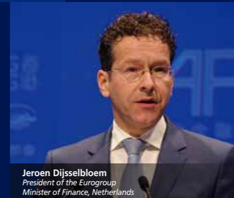
Jeroen Dijsselbloem President of the Eurogroup Minister of Finance, Netherlands