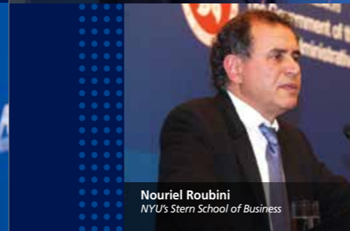
Nouriel Roubini NYU's Stern School of Business