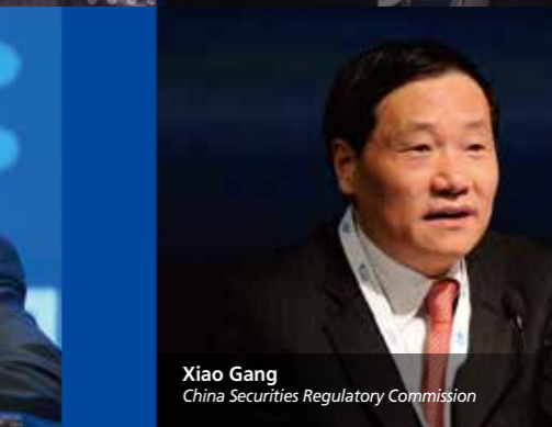
Xiao Gang China Securities Regulatory Commission