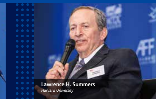
Lawrence H. Summers Harvard University