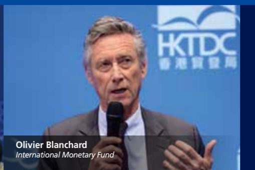
Olivier Blanchard International Monetary Fund